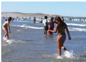
Sierra Grande (Río Negro) Iron - 400 m