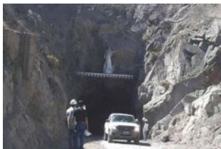
Sierra Grande (Río Negro) Iron - 400 m