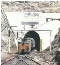
Mina Aguilar (Jujuy) Lead, Silver and Zinc - 800 m