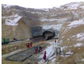
Pascua Lama (San Juan) Gold and Silver - 1500 m