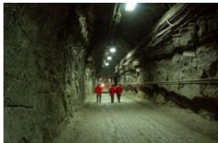
El Teniente (Chile) Copper - 700 m